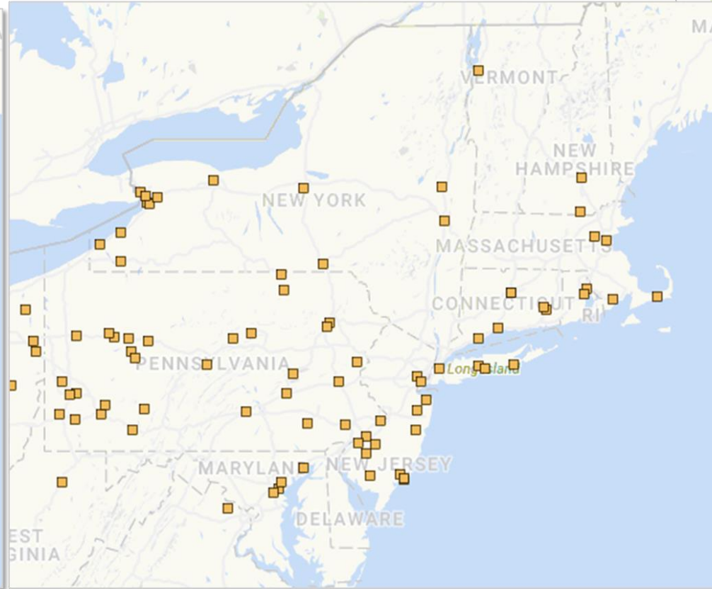
Existing DC Fast Charge Stations NE