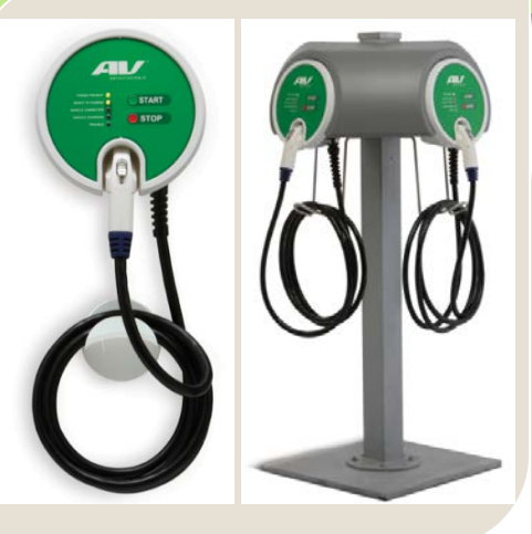
Auto Makers' Most Favorite EVSE Walmount, Plug-in, Pedestal, Indoor, Outdoor