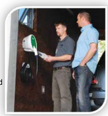
Best-in-Class Installation Service Nationwide network of Installers