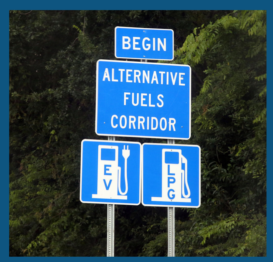
I-26 (South Carolina)